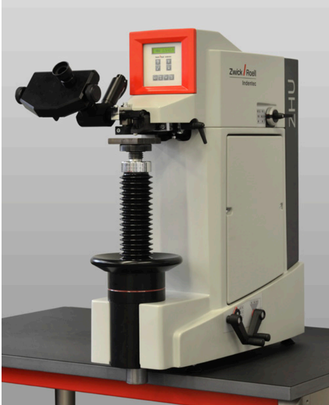
ZHU8187.5 Universal Hardness Tester

ZHU - Universal hardness testers up to 187.5 kg